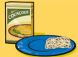
Cooked pasta or couscous 125 mL (½ cup)