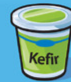
Kefir 175 g (¾ cup)