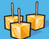
Cheese 50 g (1 ½ oz.)