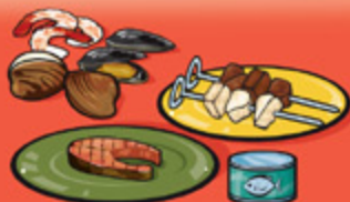
Cooked fish, shellfish, poultry, lean meat 75 g (2 ½ oz.)/125 mL (½ cup)