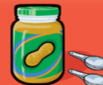
Peanut or nut butters 30 mL (2 Tbsp)