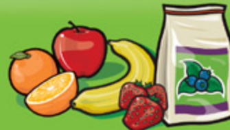
Fresh, frozen or canned fruits 1 fruit or 125 mL (½ cup)