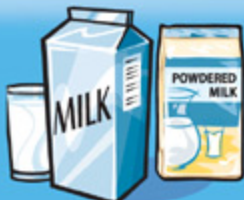
Milk or powdered milk (reconstituted) 250 mL (1 cup)