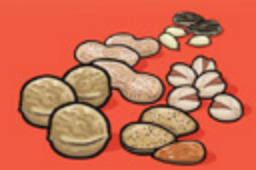
Shelled nuts and seeds 60 mL (¼ cup)