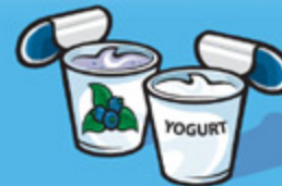
Yogurt 175 g (¾ cup)